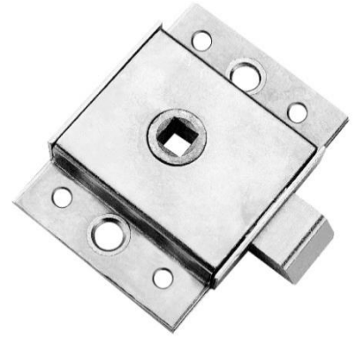
GD13-G02732 (with 6.5 mm holes & 16 mm bolt)